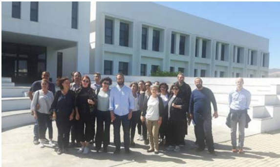
The team outside ICS-FORTH building