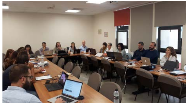
Discussion in room 211